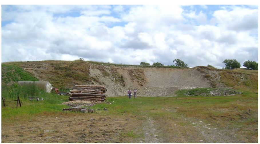
Fig 2 The Gravel Pit As Existing